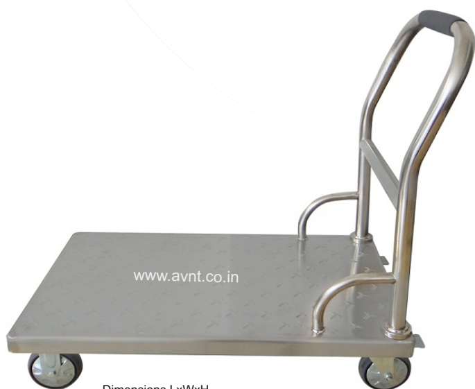
Dimensions LxWxH 100 x 60 x 11 Centimeters Capacity: 600kg