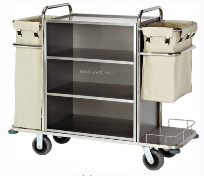
Model: EHT006 Size: L56"xW18"xH48"