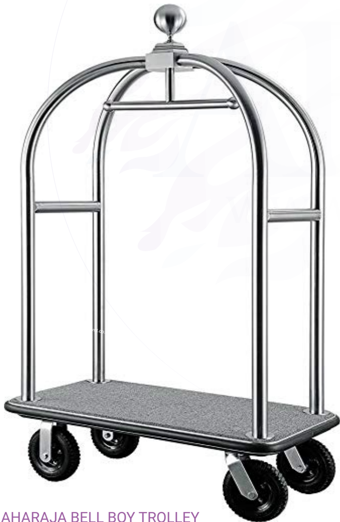
MAHARAJA BELL BOY TROLLEY MODEL: EMT001