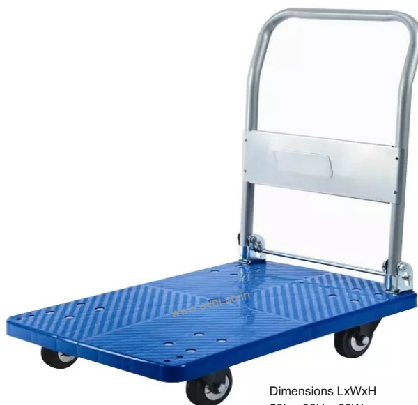
Dimensions LxWxH 59L x 90H x 60W Capacity: 300kg