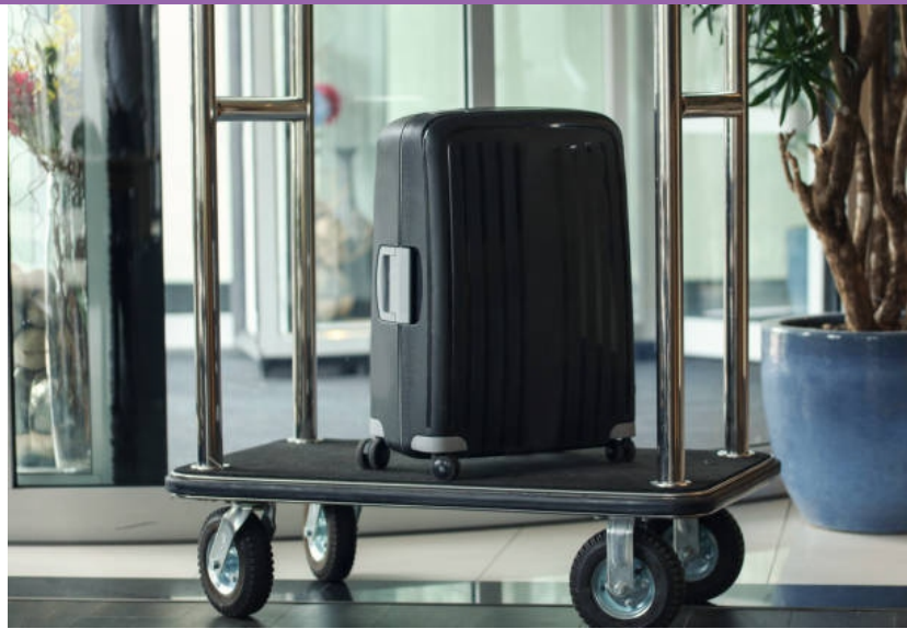
PLATFORM LUGGAGE CART MODEL: EPT003