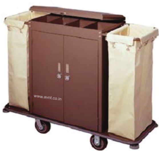
Model: EHT003 Size: L60"xW18"xH44"