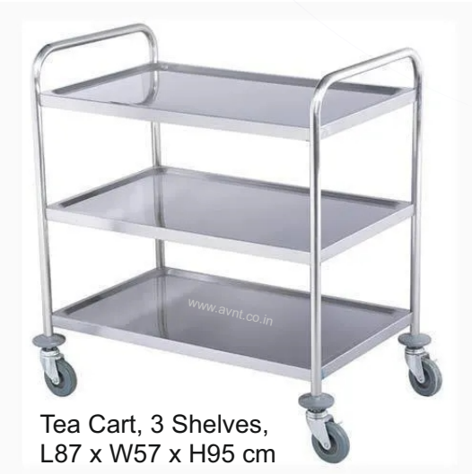
Tea Cart, 3 Shelves, L87 x W57 x H95 cm