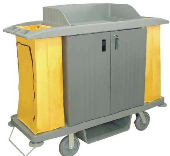
Model: EHT007 Size: L60"xW21"xH39"

Specifications are subject to change without prior notice due to continuous product development