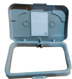
NKA1 1x Tray With LID 1x Tray with Divisions and Lid