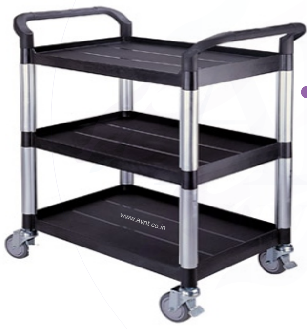
● Clearance Trolley Black 3 Tier Dimension: Tray size: 74.5cm X 48.5cm Gap between shelves: 30cm