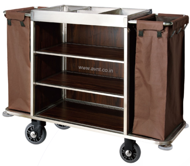
Model: EHT005 Size: L55"xW18"xH49"