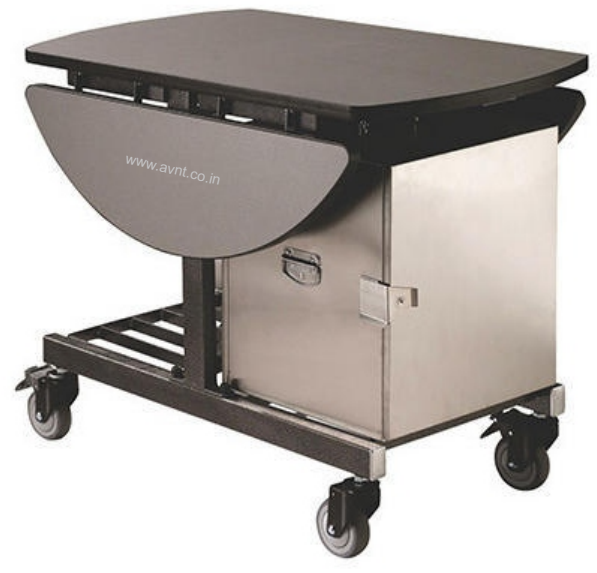
● Dimension: 92 x 92 x 85 cm, Hot Box Dimension: 44.5 x 43.5 x 41.5 cm, Capacity: 20 to 40 Kg, 25 - 30 kg