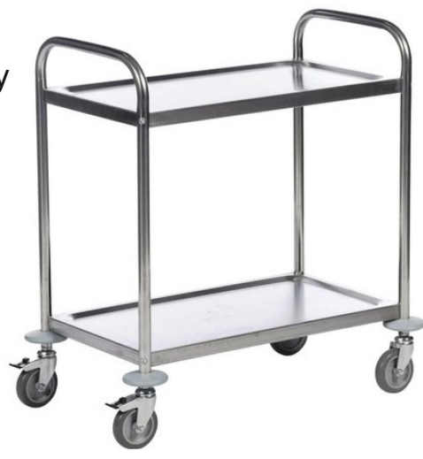
Tea Cart, 2 Shelves, L87 x W57 x H95 cm

Specifications are subject to change without prior notice due to continuous product development