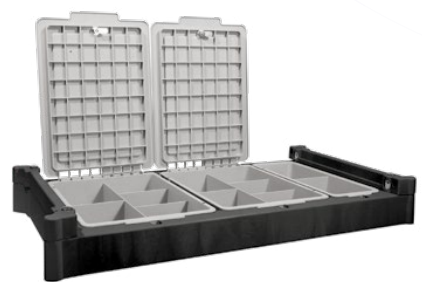
NKA2 2XTray with Divisions Lid 1xHalf Tray not included