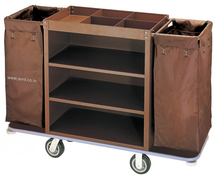
Model: EHT002 Size: L55"xW18"xH44"