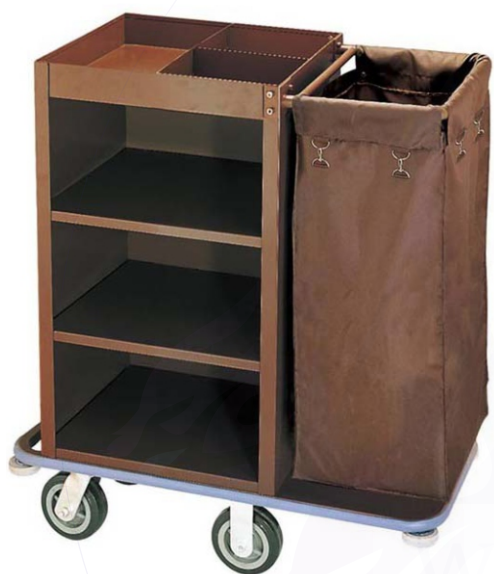
Model: EHT001 Size: L39"xW18"xH44"