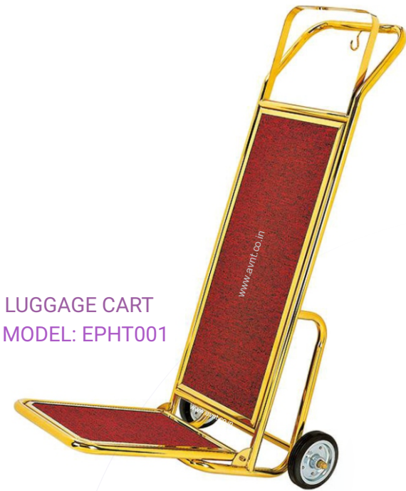
LUGGAGE CART MODEL: EPHT001